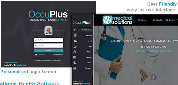
Personalised login Screen